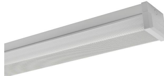
Designed in Australia to comply with the requirements of AS2293.3: 2005 and AS/NZS CISPR15: 2017

Victoria (Head Office & Manufacturing) Website: www.clevertronics.com.au Email: info@clevertronics.com.au Phone: +61 3 9559 2700 Fax: +61 3 9559 2799